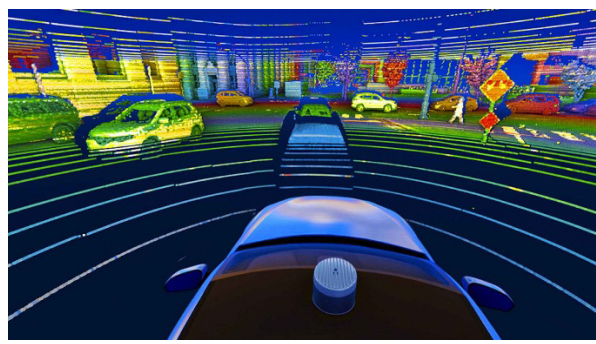
A) Providing perception to Autonomous Vehicles by Laser Imaging, Detection, And Ranging (LIDAR)

LIDAR is based on scanning an object or a surface with a laser or set of lasers. It is nowadays used in thousands of applications requiring high-resolution maps, as surveying, geodesy, archaeology, geography, geology, geomorphology, seismology, forestry, atmospheric physics, etc. [1]. Recently it is being used for navigation of autonomous cars, and even for the helicopter Ingenuity recording the terrain of Mars [2]. Figures A and B provide some example of LIDAR perception and LIDAR object identification using AI techniques.